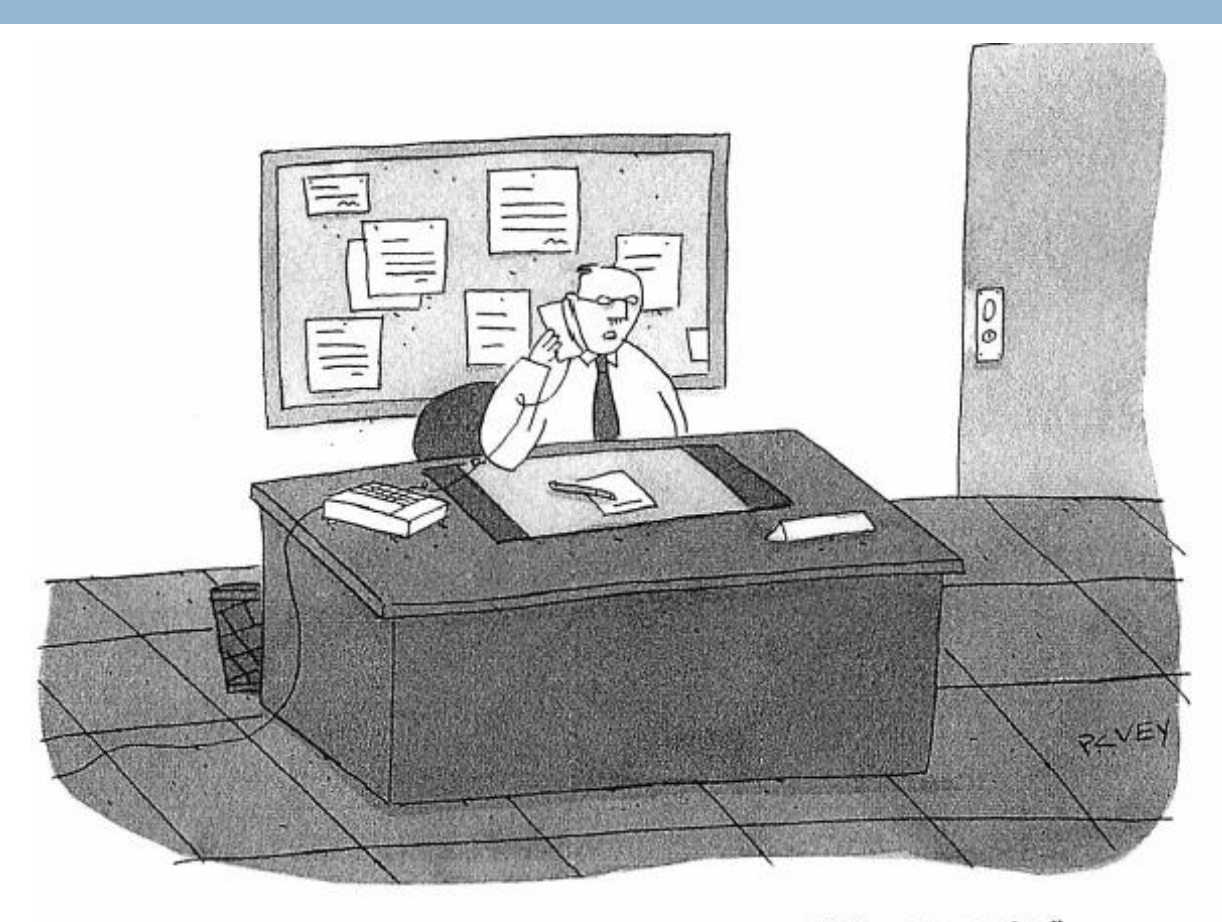
"I'd get my people on that right away if I had people."