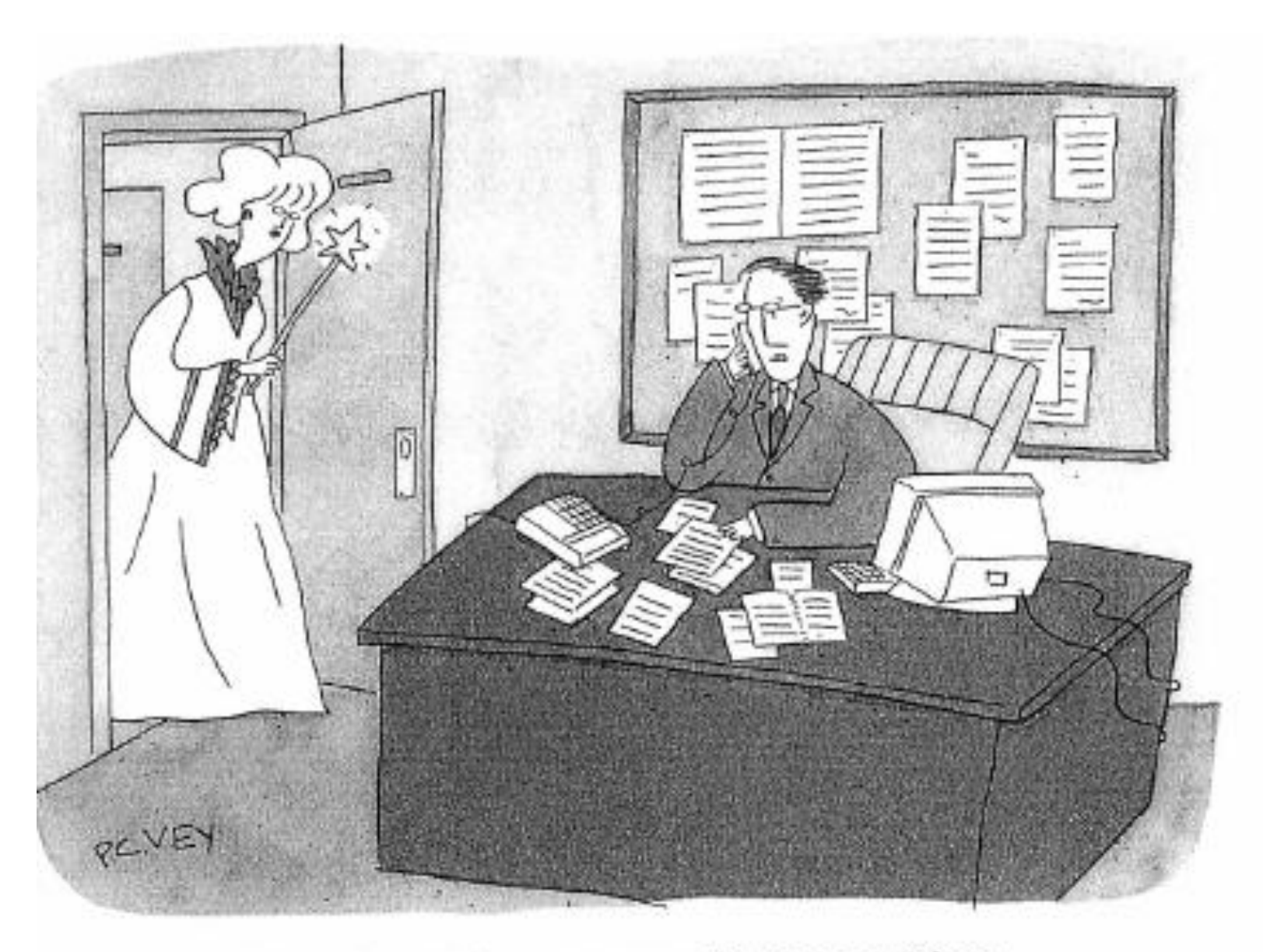
"Now I've got to come up with three wishes, as if I'm not already under enough pressure."