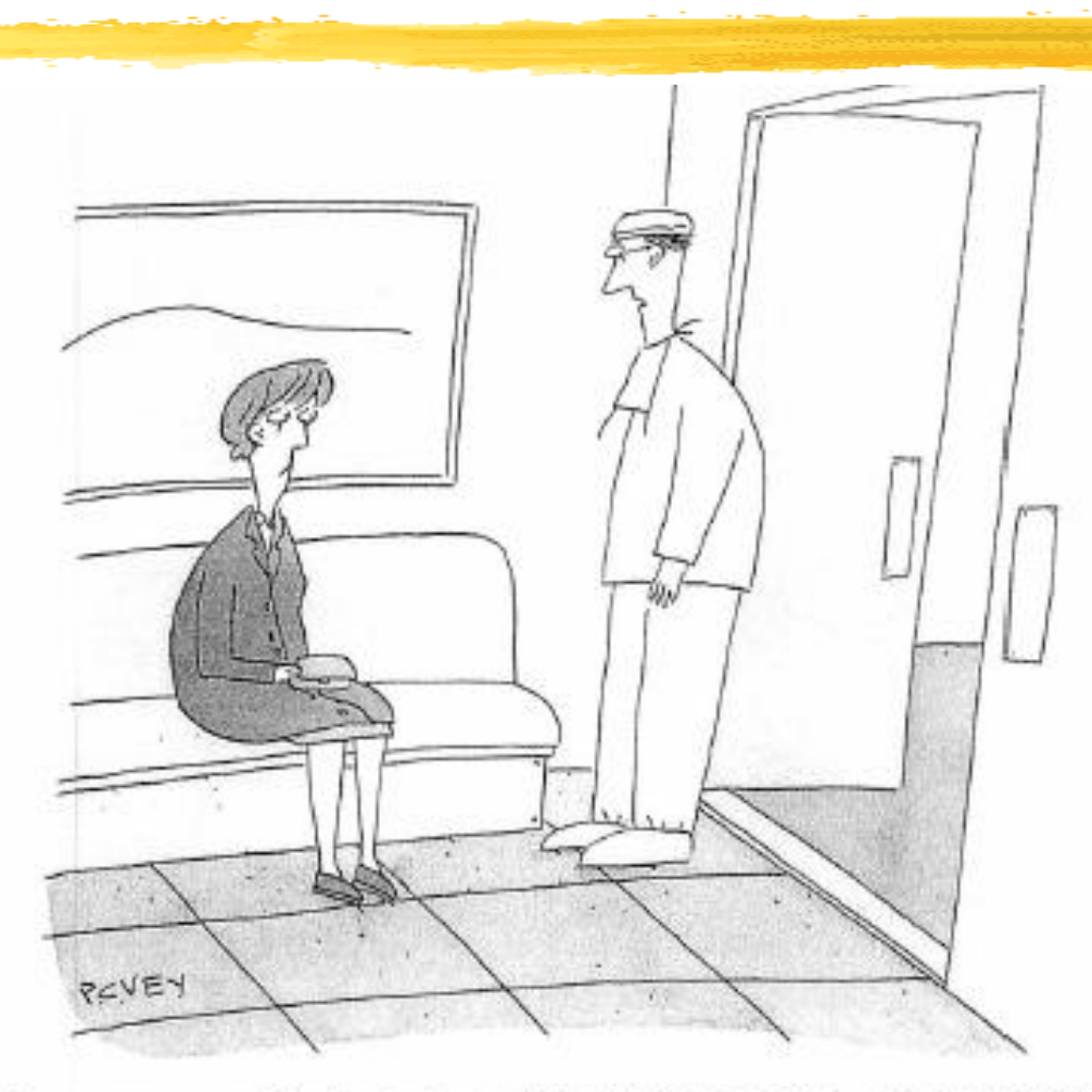
"The nurses and technicians did all they could— I just wasn't into it."